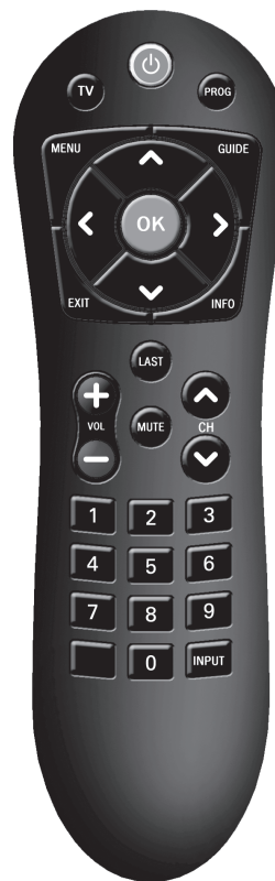
OCE-0189B REV 06 (03/21/23)